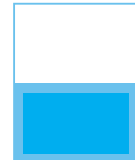
Trim area 4,25" x 5,5" Live area 3,75" x 5"

All graphic data must be submitted in PDF format, 300 dpi and CMYK color space. Texts best converted to vector.